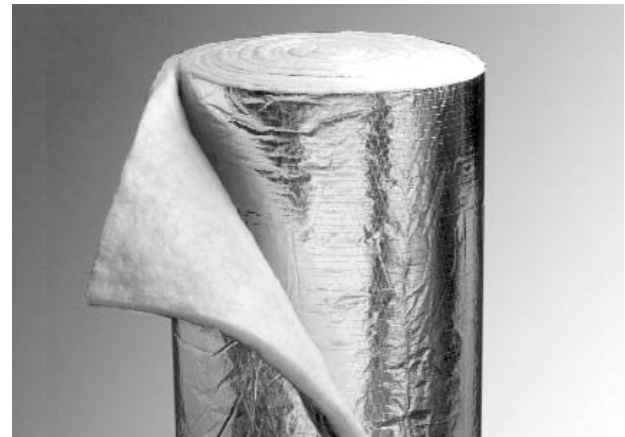
Operating Temperature Limits: 40°F to 250°F (4°C to 121°C) Faced